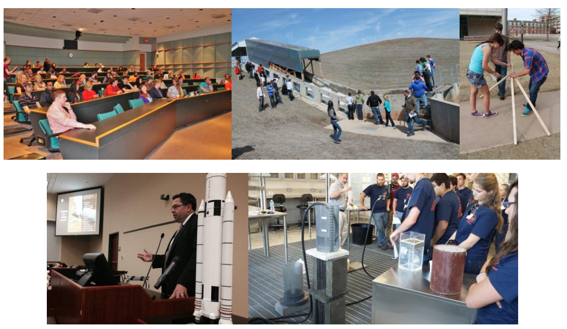
Figure 3. ASABE Student Rally Examples of (from left to right, top to bottom) the student business meeting, a field tour, a student team design activity, a NASA keynote speaker, and a lab tour