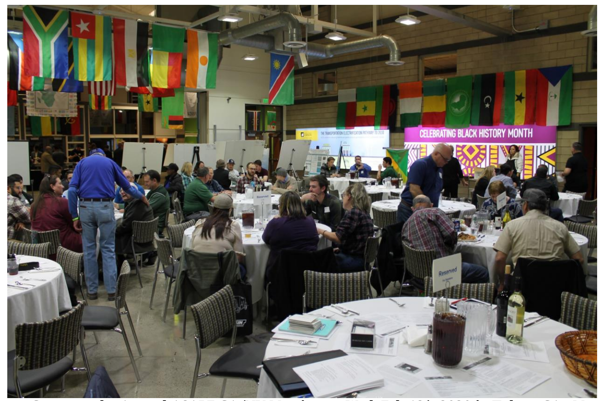
Guests at the Annual ASABE CA/NV Meeting on Wed, Feb 12<sup>th</sup>, 2020 in Tulare, CA. More photos from this meeting can be found at Meeting Photos.

The CA/NV Section Annual Meeting took place on Wednesday, February 12^{\rm th} , 2020 in conjunction with the World Ag Expo (Tulare Farm Show) at the Southern California Edison Energy Education Center in Tulare, CA. The event was well attended with about 100 guests.