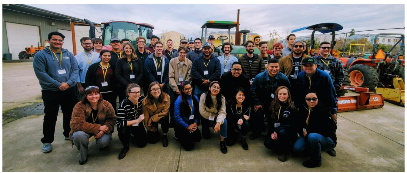
Students at the 1st ASABE CANV Student Rally. Photo taken after the Student Design Competition, outside of the Western Center for Agricultural Equipment (WCAE) at UC Davis. More photos from the Rally can be found at Rally Photos.

The Inaugural ASABE CA/NV Section Student Rally took place from January 17 to 20th, 2020 at UC Davis. The idea of having a Rally was first introduced at the 2019 Annual CA/NV Meeting. Rallies are meant to be enriching experiences that provide students with opportunities to: