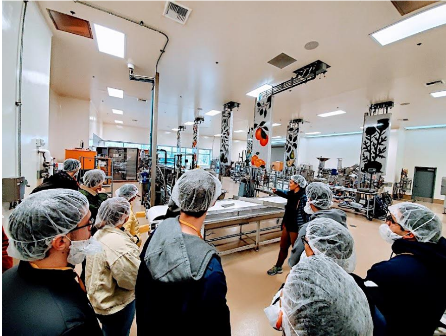
Students at the 1st ASABE CANV Student Rally.

Photo captured while visiting the California Processing Tomato Industry Pilot Plant, at UC Davis. More photos from the 2020 Rally can be found at Rally Photos .